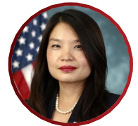
Debbie W. Seguin , Assistant Commissioner, U.S. Customs and Border Protection, Office of International Affairs, Department of Homeland Security