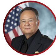
Pete Flores , Deputy Commissioner, US Customs and Border Protection, Department of Homeland Security