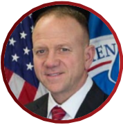
Sean Haglund, Office of Bombing Prevention, Cybersecurity and Infrastructure Security Agency (CISA), Department of Homeland Security

THANK YOU TO ALL OUR SPEAKERS FOR PROVIDING THOUGHT-PROVOKING AND ENGAGING PRESENTATIONS!